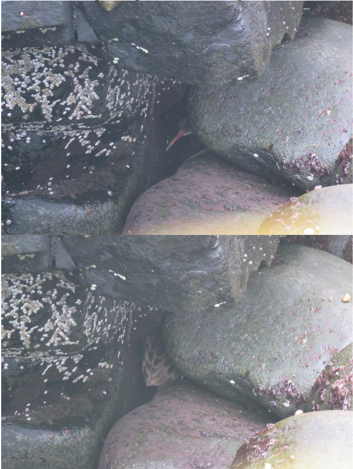
Spot the bird...Water Rail hiding under rocks (Ciaran Hatsell)

32 Wigeon, 2 Teal, 21 Common Scoter, 4 Long-tailed Duck (1 drake) north along east side, 2 red-throated Diver, 82 north Sooty Shearwater, 15 north Manx Shearwater, 50 redwing, 11 Song Thrush and 1 Brambling