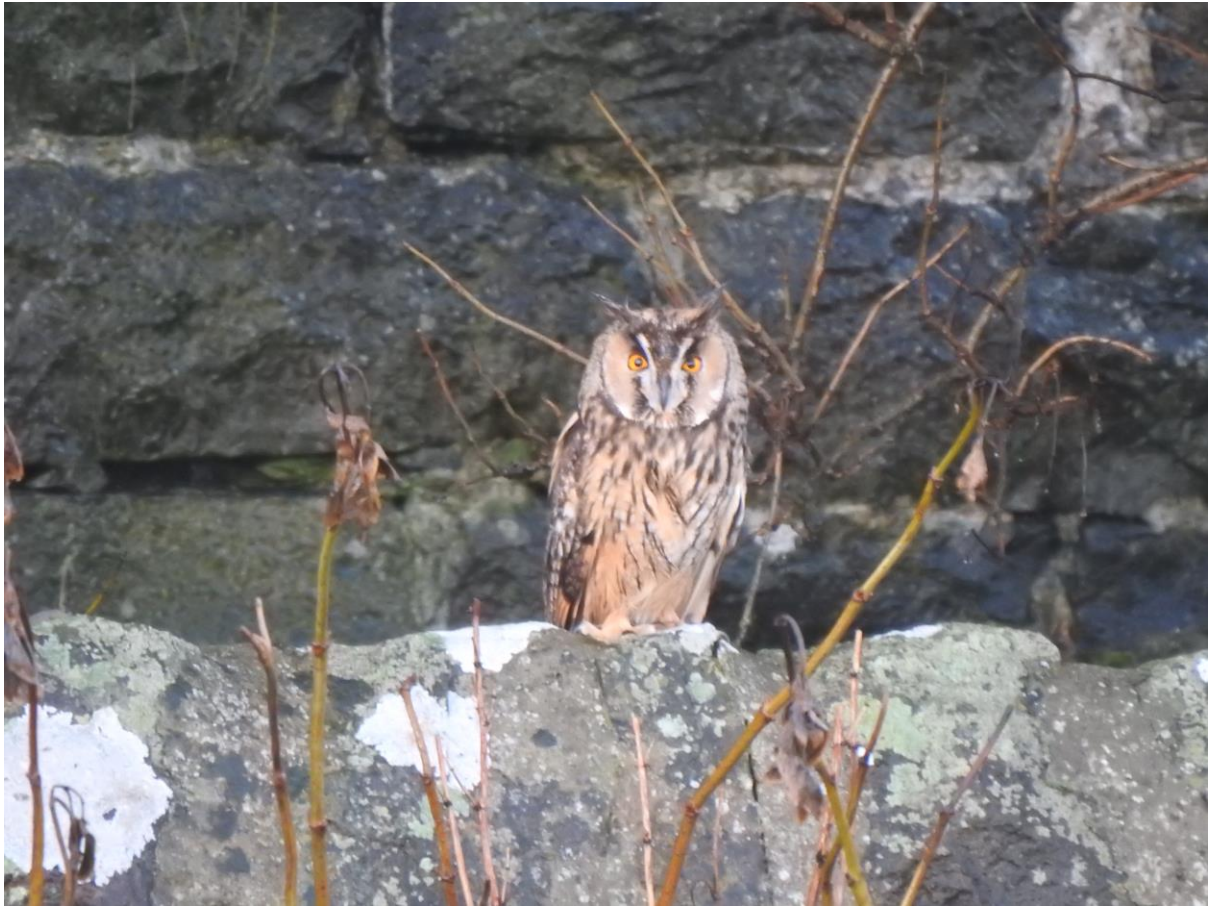
Long-eared Owl on the wall at the lighthouse (David Steel)