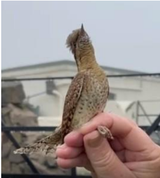
Wryneck caught and ringed