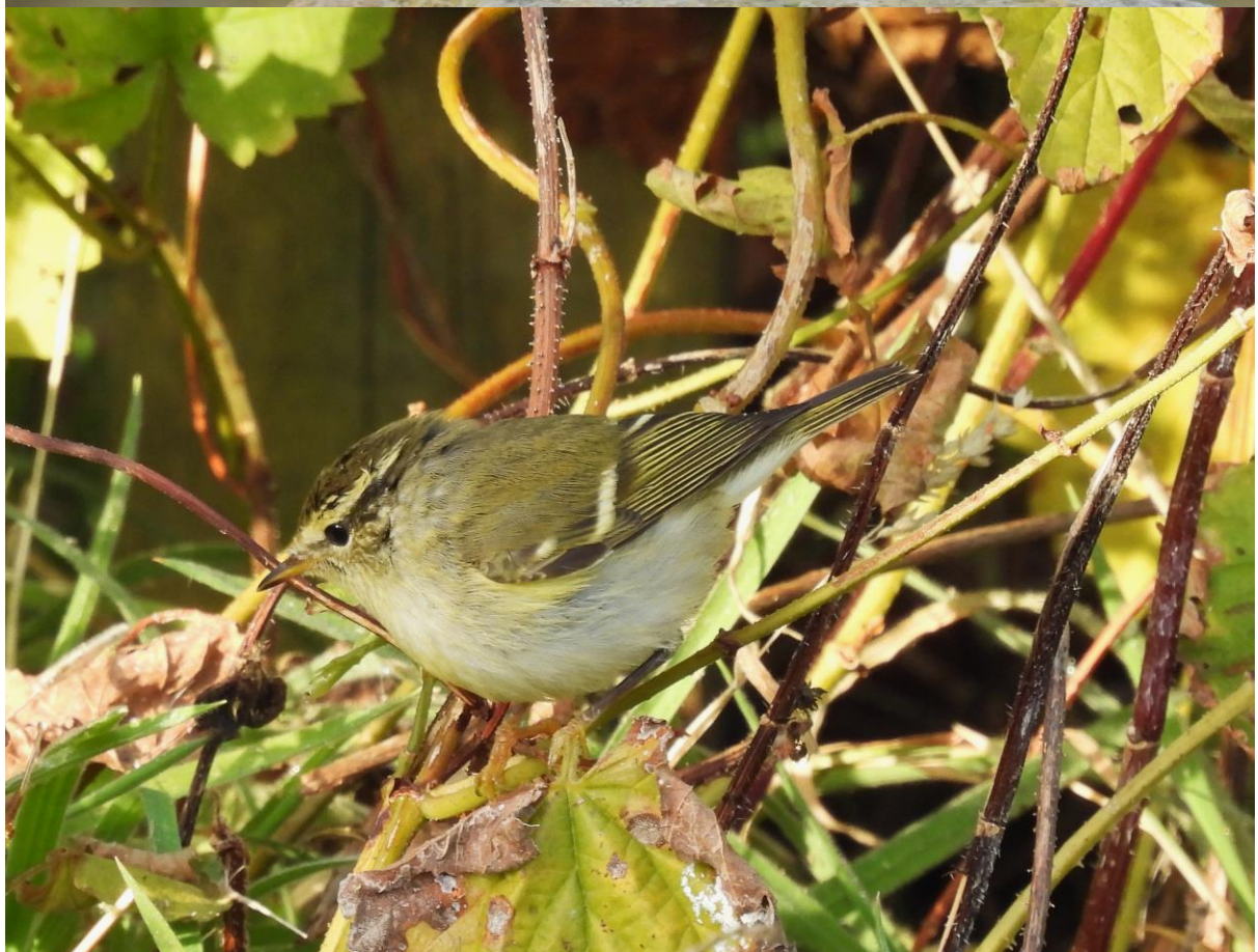
Starling (left) and Yellow-browed Warbler (right)