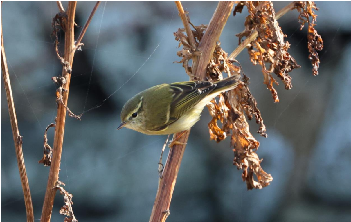
Yellow-browed Warbler (Simon Pinder)