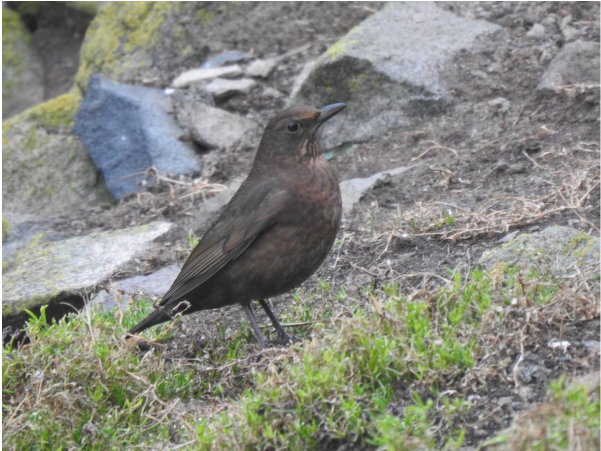
Blackbirds on the move (David Steel)