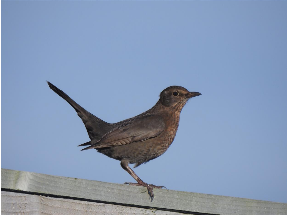
Saturday 28 th September (the Bird Observatory 90 th birthday!) Highlights: