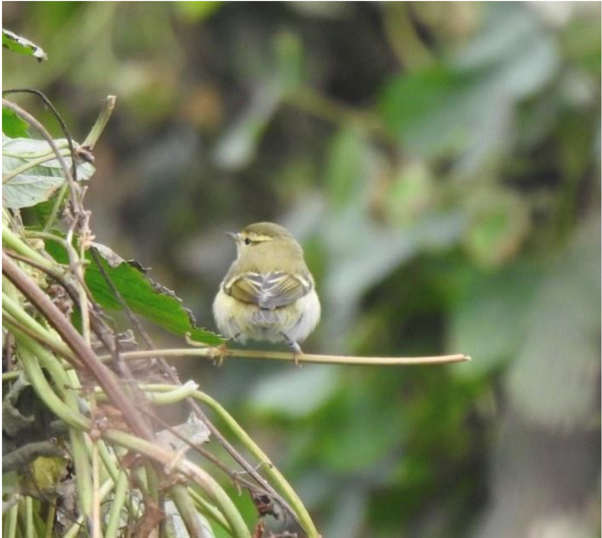
Yellow-browed Warblers (David Steel)