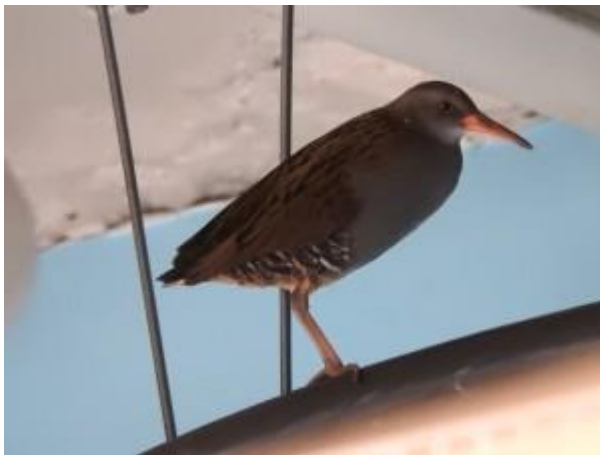
Water Rail in engine room! (David Steel)

Highlights: Wryneck 1 caught and ringed in the Low Trap, Grey Plover 1 at south end (first of the year), 1 juvenile Cuckoo still present, 2 Whitethroat, 1 Sedge Warbler, 2 Garden Warbler.