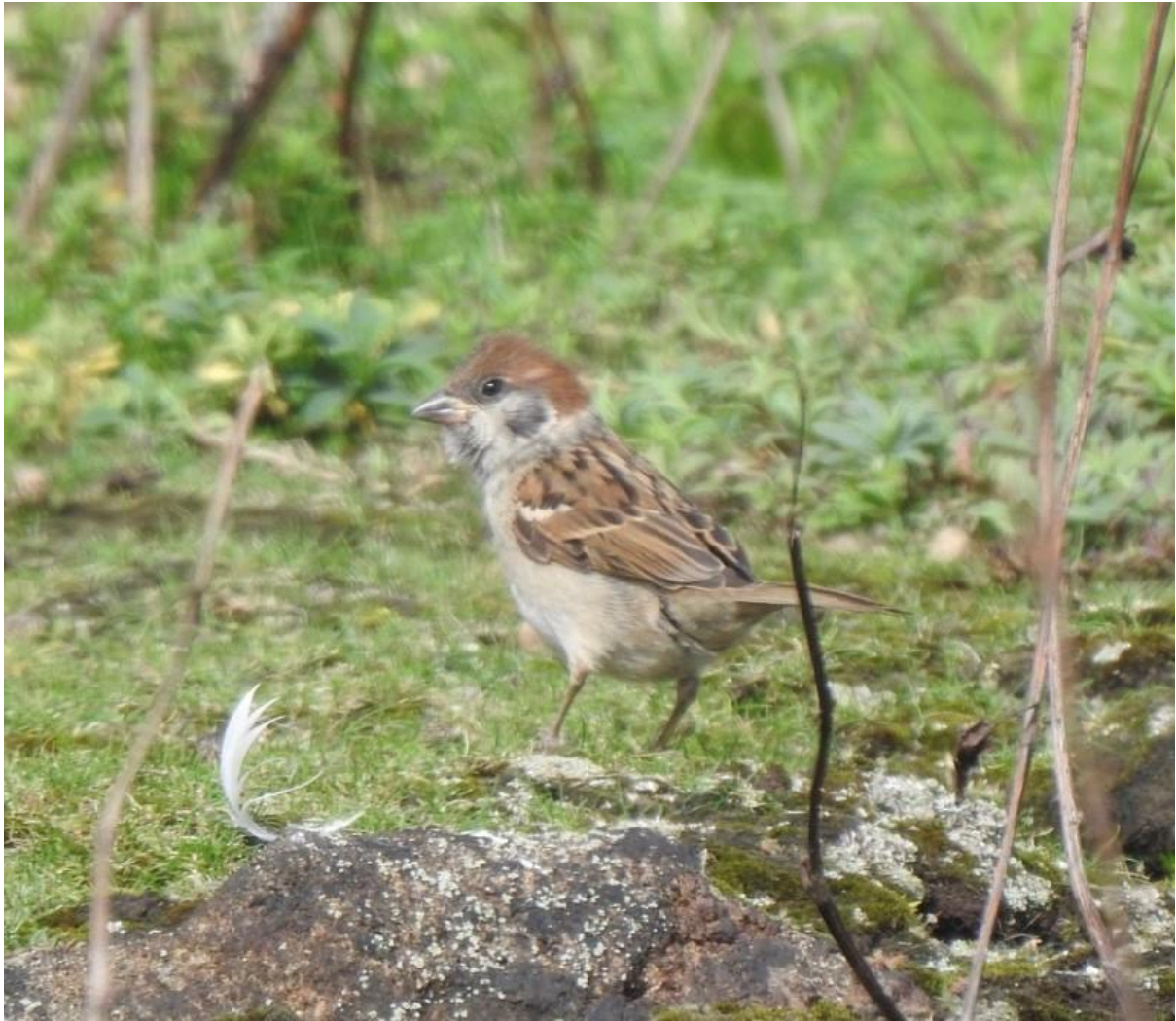
Migrating Tree Sparrows (David Seel)

86 Pink-footed Geese, 16 Teal, 1 Hen Harrier (2 nd of the year), 1 Greenshank, 2 Arctic Skua, 1 Sooty Shearwater, 27 Manx Shearwater, 16 Tree Sparrow , 1 Hooded Crow (first this year) near the Kettle area.