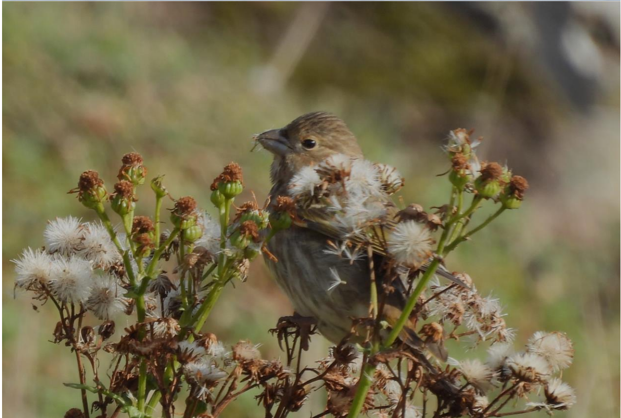
Barnacle geese (left), Common Rosefinch (right)