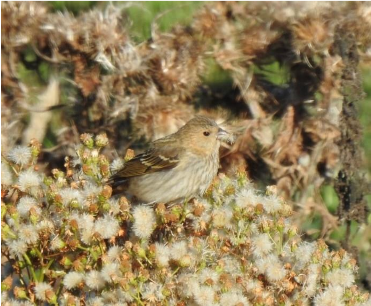
ringed Common Rosefinch