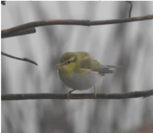
Wood Warbler (David Steel)

Highlights: 38 west Red-throated Diver, 4W Goosander, 1W Pintail , 3W Wigeon, 4 Teal, 6 Manx Shearwaters, 10 Pied Flycatcher, 3 Spotted Flycatchers, 2 Reed Warbler, 1 Garden Warbler, 4 Whinchat and 1 Tree Pipit.