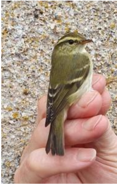
yellow-browed Warbler (Gordon McDonald)