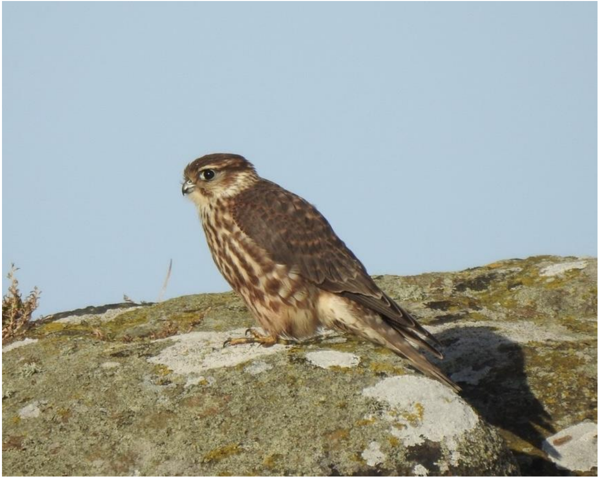
Sparrowhawk (left) and merlin (right)

80 Pink-footed Geese, 14 Whooper Swan south, 11 Common Scoter, 1 Lapwing, 2 Little Auk , 11W Red-throated Diver, 1 Sparrowhawk, 1 Long-eared Owl in Low trap, 1 Short-eared owl, 1 Merlin, 1 Chiffchaff, 1 Chaffinch, 1 Brambling, 1 Twite, 1 Common Redpoll , 1 Snow Bunting along east side flying north-west.