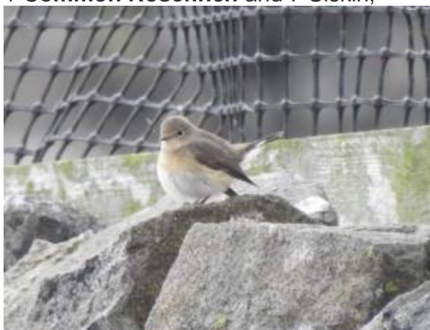
Red-breasted Flycatcher (David Steel)

1 Ringed Plover, 1 Snipe, 3 Kestrel, 17 Yellow-browed Warblers (including 7 ringed), 5 Willow Warbler, 15 Chiffchaff, 1 skulking Grasshopper Warbler , 4 Blackcap, 2 Garden Warbler, 1 blythi Lesser whitethroat , 3 Whitethroat, 2 immature Red-breasted Flycatcher for 4 th day at Low light bushes and 2 nd day at visitor centre, 3 Redstart, 1 Whinchat, 1 Stonechat, 1 Grey Wagtail, 2 Brambling, 1 Common Rosefinch and 7 Siskin,