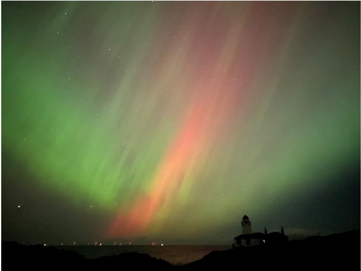
Northern lights off the low light (David Steel)