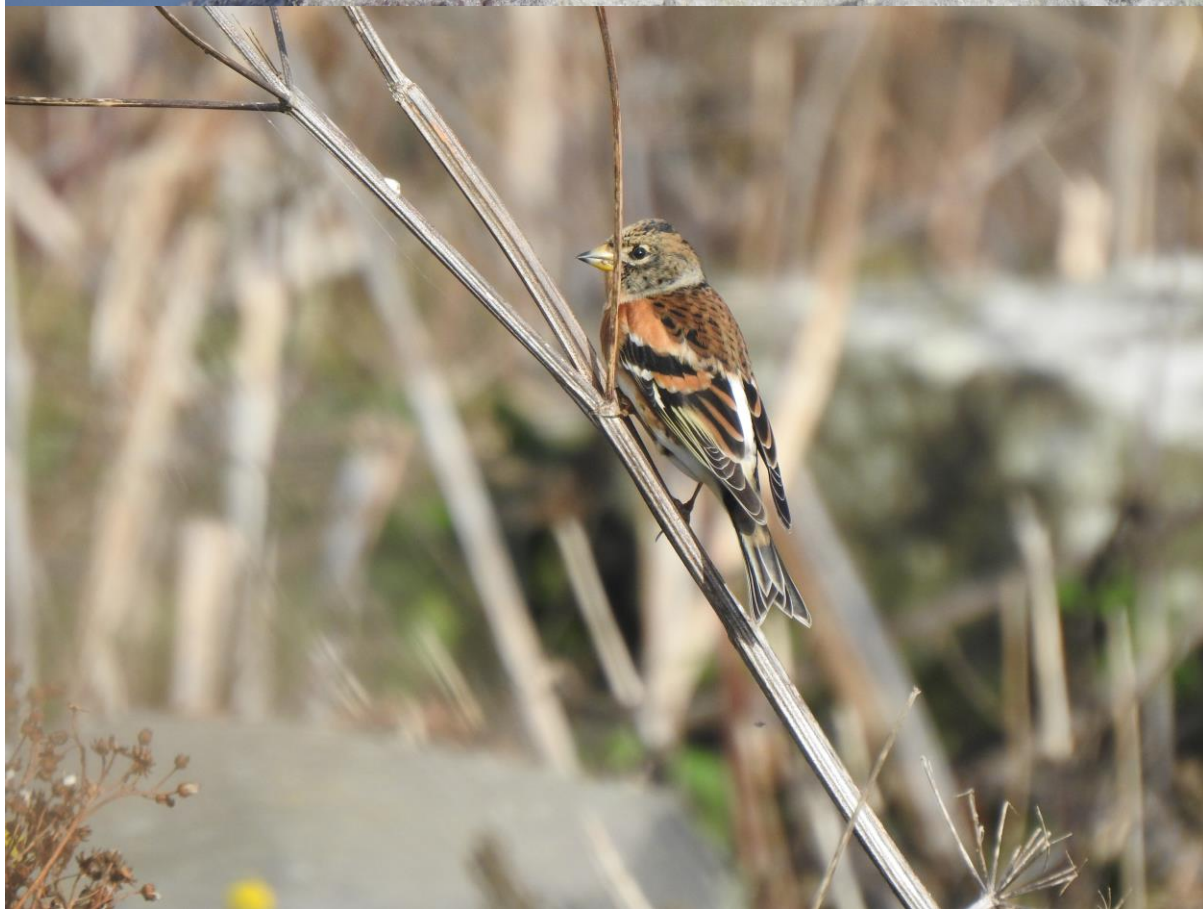
Brambling on the move