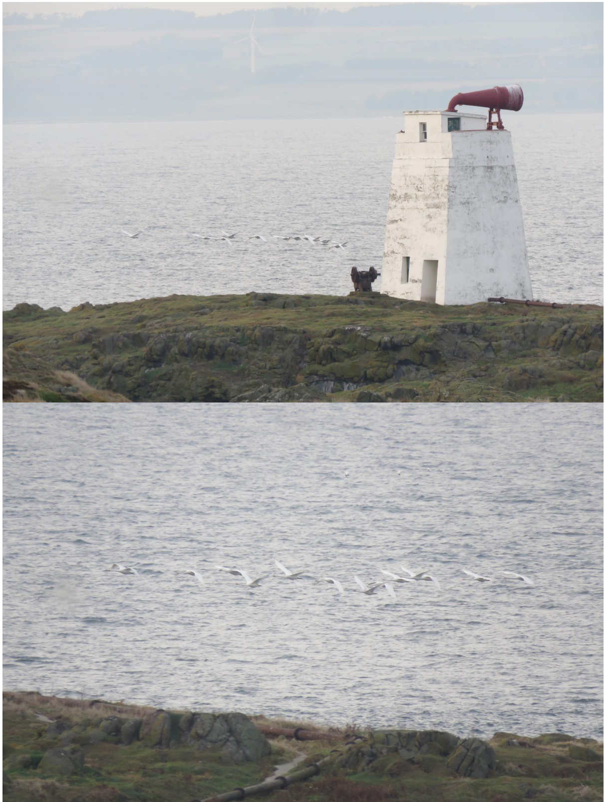
Whooper Swans moving west (Ciaran Hatsell)

Saturday 5 th October Highlights 2 Yellow-browed Warbler