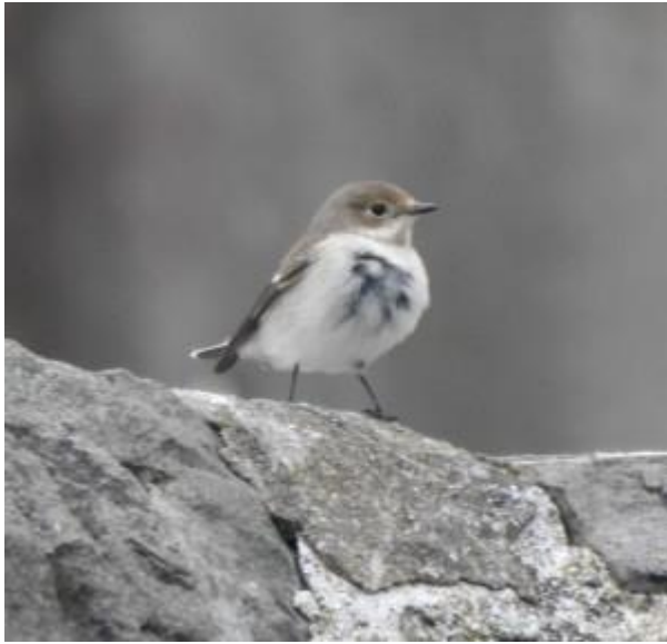
Pied Flycatcher (David Steel)