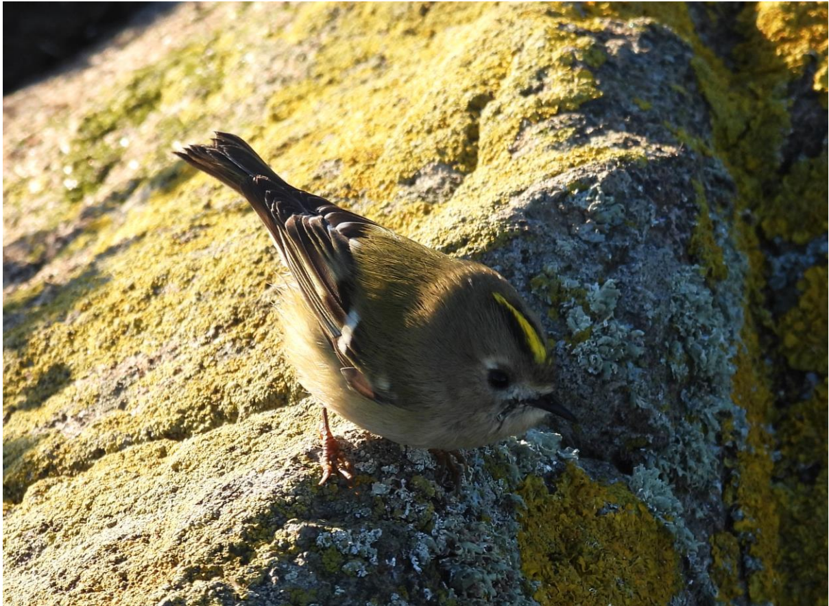
Common Rosefinch (left) and Goldcrest (right)