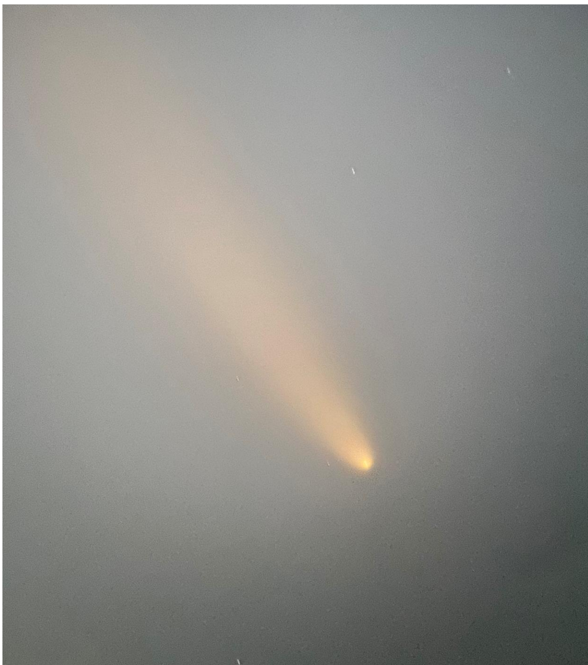
Comet C/2023 A3 (Tsuchinshan-ATLAS) over the island (David Steel)

2 Mute Swan both adult east, 11 Whooper Swans west, 51W 4N Common Scoter, 193W Eider, 2W Goosander, 6 red0-throated Diver, 1N Black-throated Diver , 1N Manx Shearwater. 1 merlin, 1 Buzzard circled south end then west, 3 Brambling, 6 Skylark, 20 Redwing, 5 Song Thrush, 10 Twite