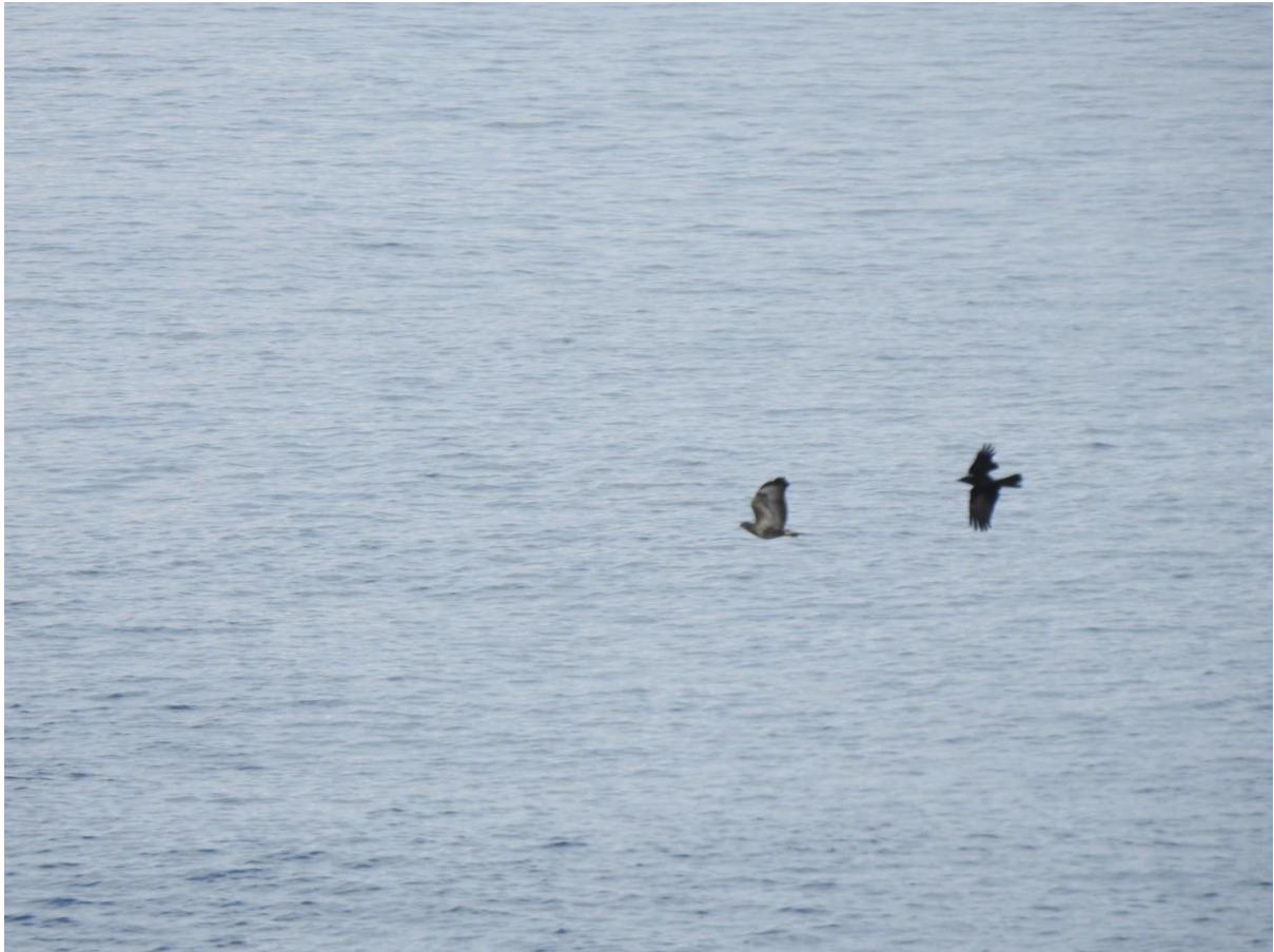
Buzzard mobbed by crows