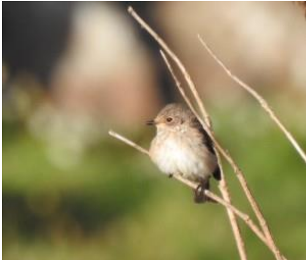
Spotted Flycatcher (David Steel)