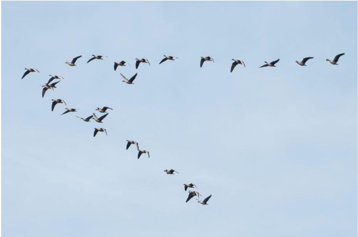
first pink-footed Geese of the autumn (David Steel)

Seawatching proved productive as all four skuas were seen whilst first Pink-footed Geese of the autumn!