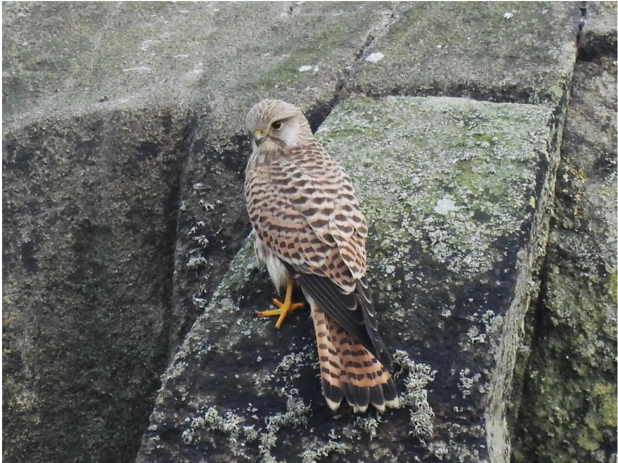
Fieldfare (right) and kestrel (left) both