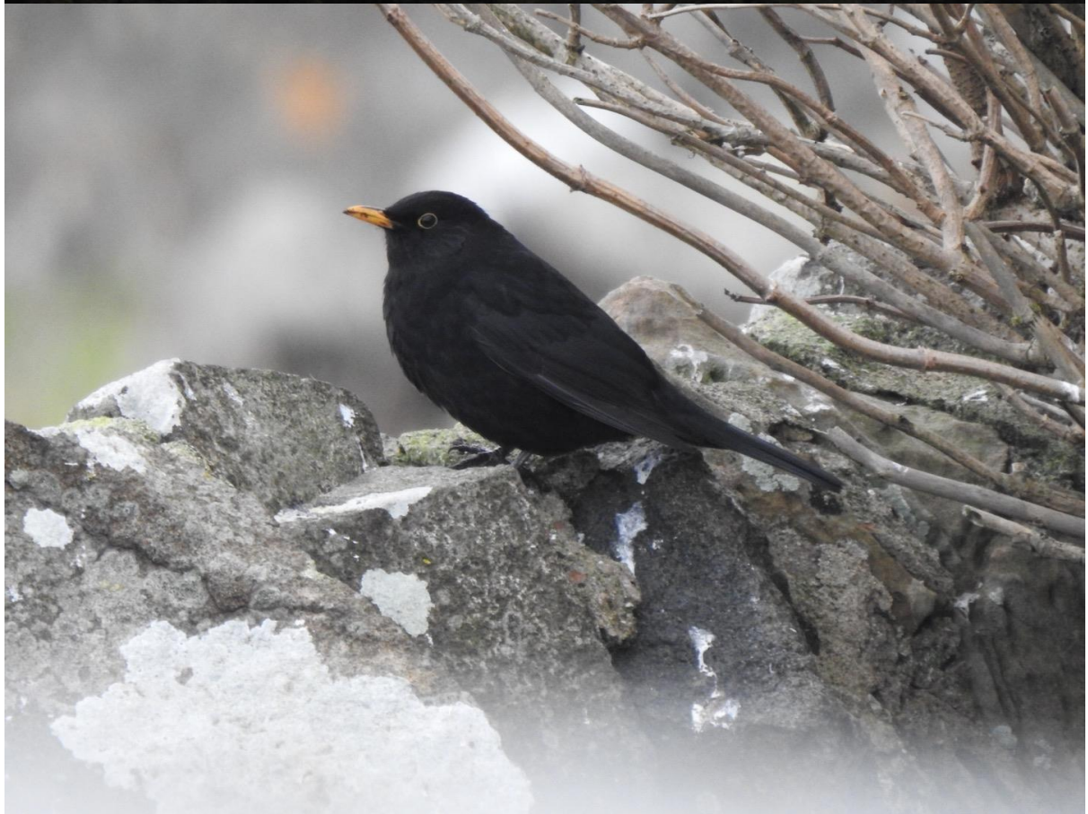
Huge numbers of Thrushes on the move